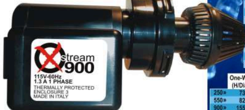
900GPH / 3800LPH