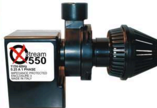
550GPH / 2200LPH