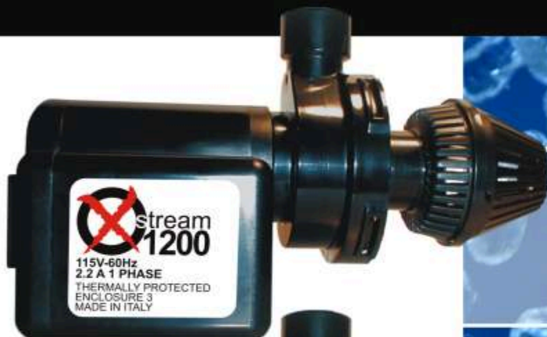
1200GPH / 4800LPH