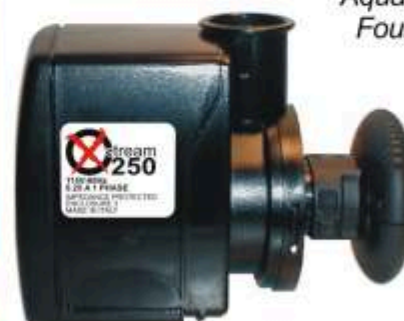
250GPH / 1000LPH

FOR USE IN: Indoor/Outdoor Gardens, Aquariums, Hydroponics, Fountains, and Ponds.